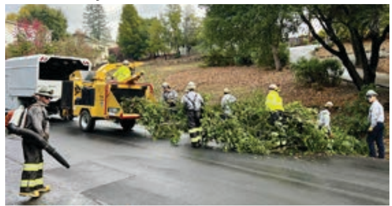
CCCFPD Hand Crew 12 at work

To reduce wildfire risk, the North BART Firewise Community held a Community Chipping Day event on Nov. 29. The community event covered North Thompson Road starting at Glen, Oak Hill Road north of Deer Hill, Orchard Road, their offshoots and several properties on Deer Hill. Chipping and hauling services were provided by Hand Crew 12 of the Contra Costa County Fire Protection District as part of their Wildfire Mitigation Program.